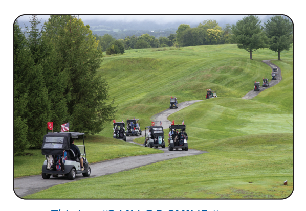
This is a "RAIN OR SHINE" event.

VISIT Sgtdavidjsmith.org FOR MORE INFORMATION